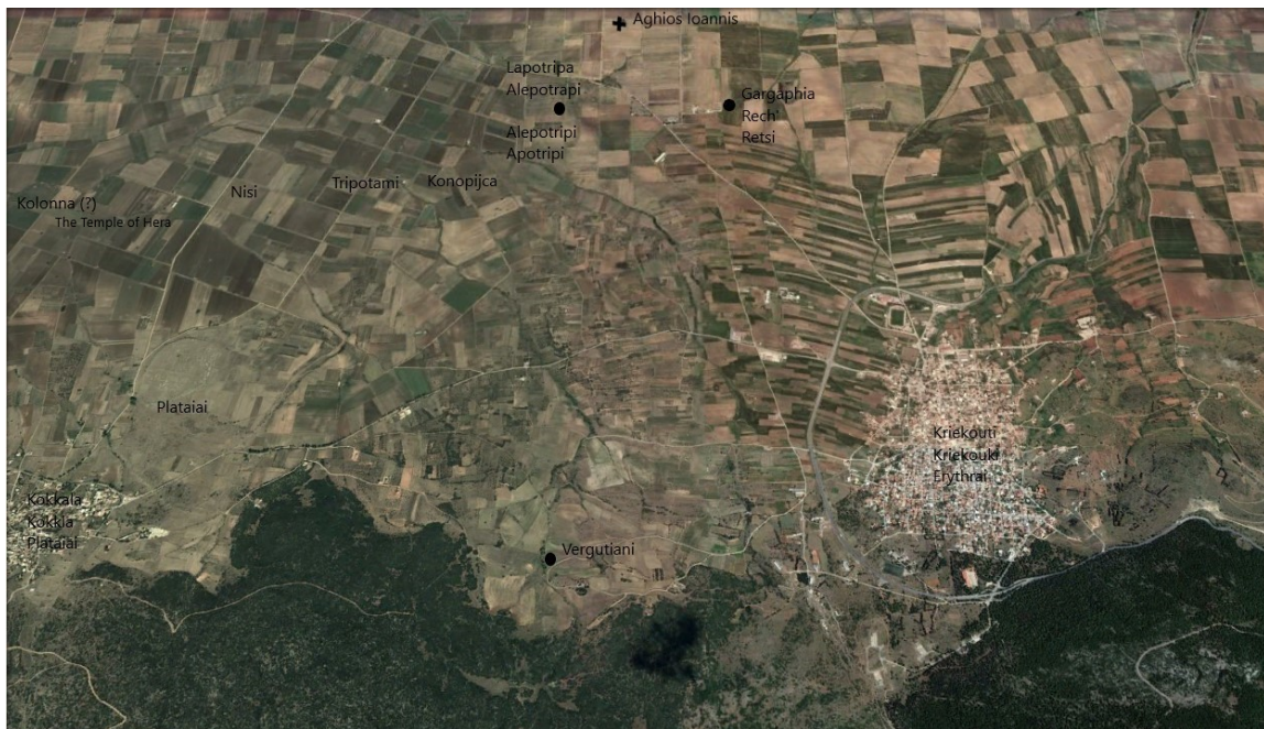
Figure 2: General map (following Koutorga's description).

columns visible in calm weather, and laid down the location of the finding upon the map. Another archaeologist of that period, A.B. Ashik, told that A.G. Bibikov, lieutenant commander of the Black Sea Fleet, later captain of the Kerch quarantine station, tried to pull one of the columns out of the water in 1823 and 1824, but was forced to give up the idea due to lack of funds (Tunkina 2002, 240, 382, Fig. 45). Note that these columns in the south of Russia were never found, despite the efforts of other well-known researchers. In this regard, we will decline to make any further comments and only approximately locate on the modern map ( Fig. 2 ) the place described by Koutorga, where, according to local residents, the columns were allegedly seen.